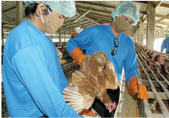
Cutting the links: health officials are culling chickens in a concerted effort to halt the spread of bird flu to humans.

The present outbreak of the highly pathogenic H5N1 virus — named for the