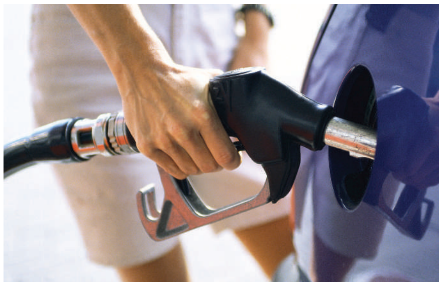
Guzzle on: the proposed US energy bill will not improve fuel efficiency in cars.